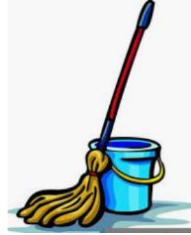
Mop & Bucket