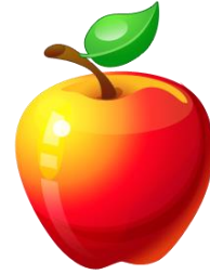
Apple (for a snack)